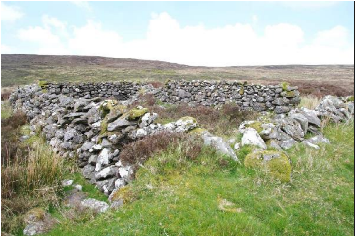
Plate 15.12: View drystone structure to east of access road between Turbines 1 and 4