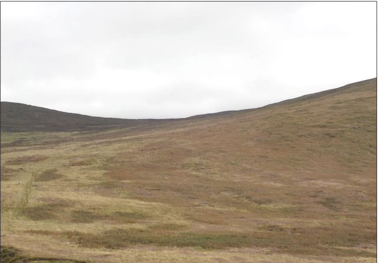
Plate 15.6: View towards location of Turbine 7 from west