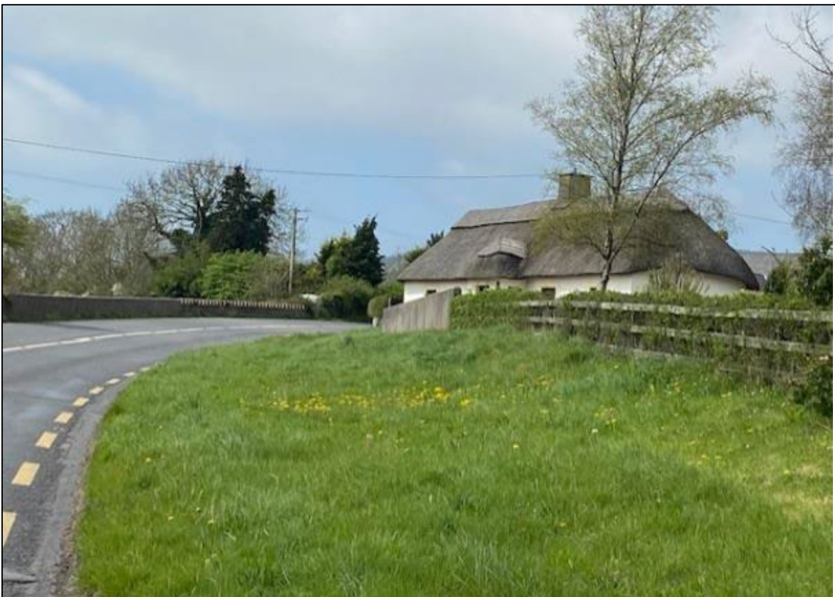
Plate 15.14: View of roadside grass verge within environs of thatched cottage Protected Structure WA750672