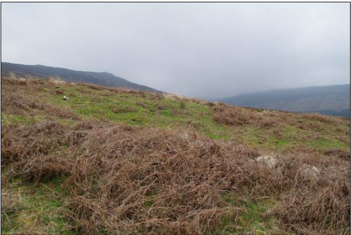
Plate 15.8: View towards location of Turbine 10 from northwest