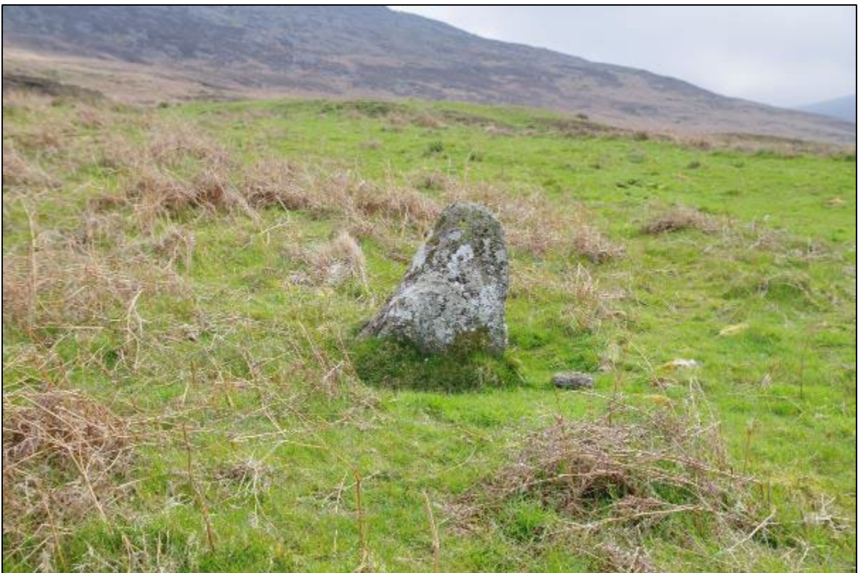
Plate 15.13: View towards location of upright stone to north of access road between Turbines 10 and 11