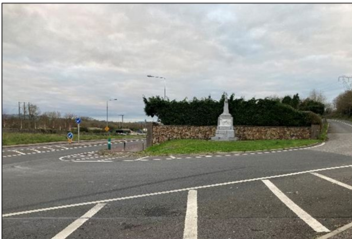
Plate 15.15: View of Master McGrath Monument (NIAH 22903003) from east