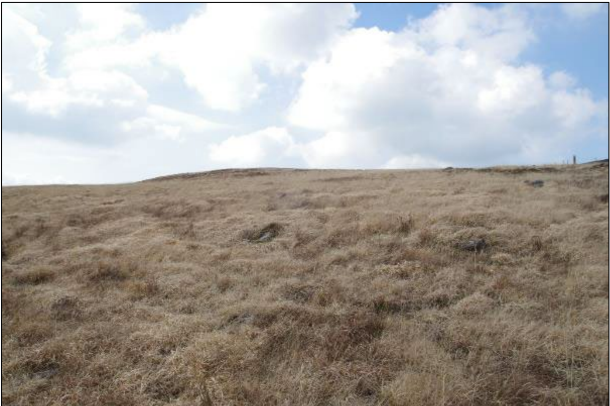
Plate 15.2: View towards location of Turbine 2 from south