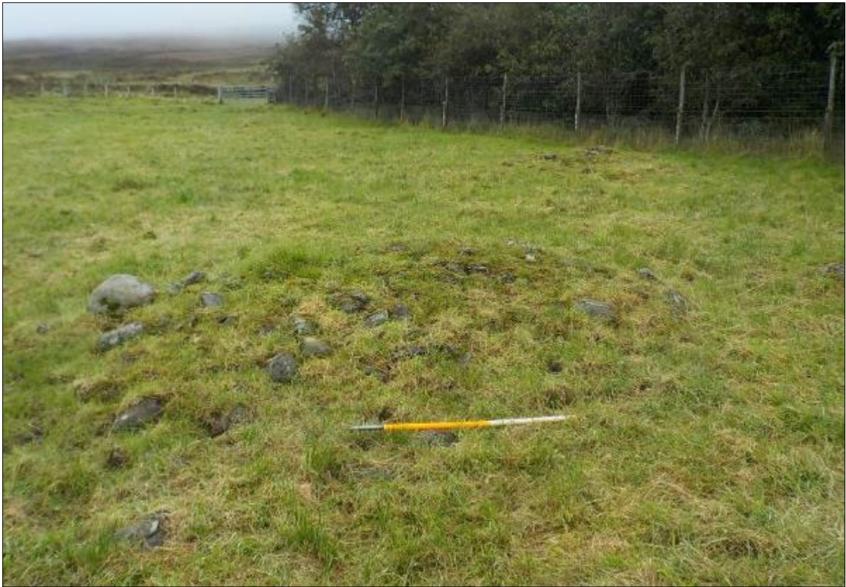
Plate 15.14: View of previously unrecorded field cairn in reclaimed lands to south of Turbine 10