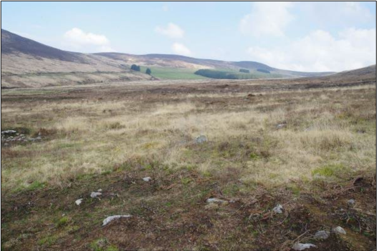
Plate 15.7: View towards location of Turbine 8 from south