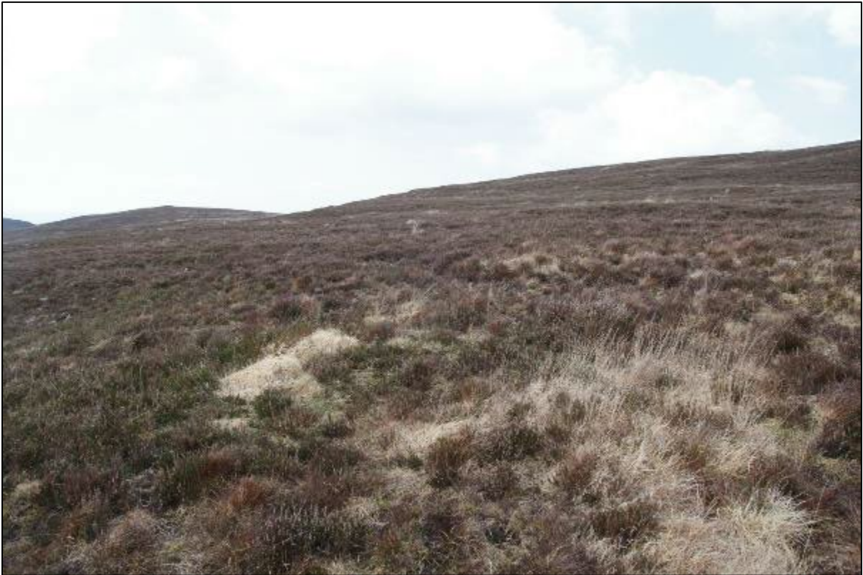
Plate 15.3: View towards location of Turbine 4 from north