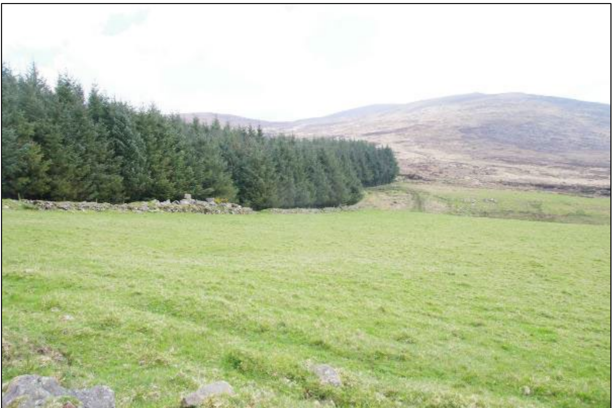
Plate 15.10: View towards location of construction compound from west