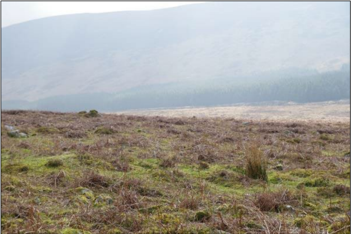
Plate 15.9: View towards location of Turbine 11 from north