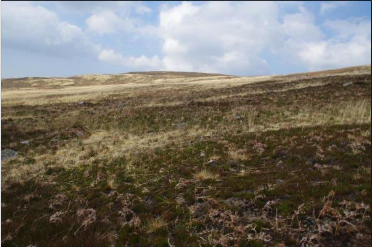
Plate 15.1: View towards location of Turbine 1 from south