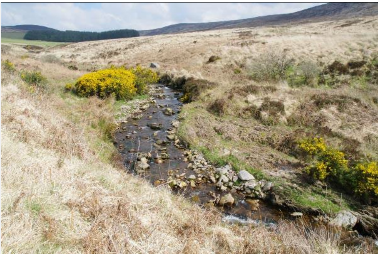
Plate 15.15: View of stream within Site from south