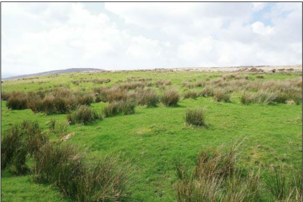
Plate 15.4: View towards location of Turbine 5 from northeast