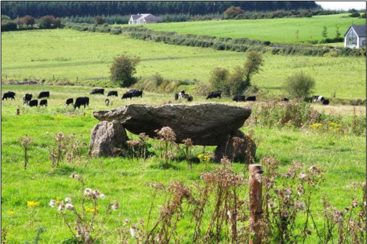
Plate 15.16: View of stone structure of potential modern date within environs of green field section of GCR in Reanadampaun Commons townland