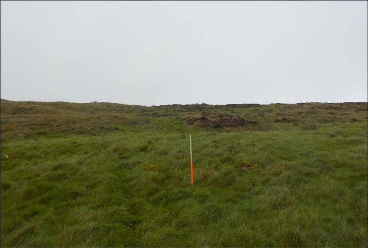
Plate 15.5: View towards location of Turbine 6 from west